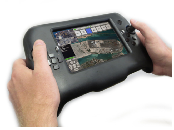
Lockheed Martin Procerus Hand Controller