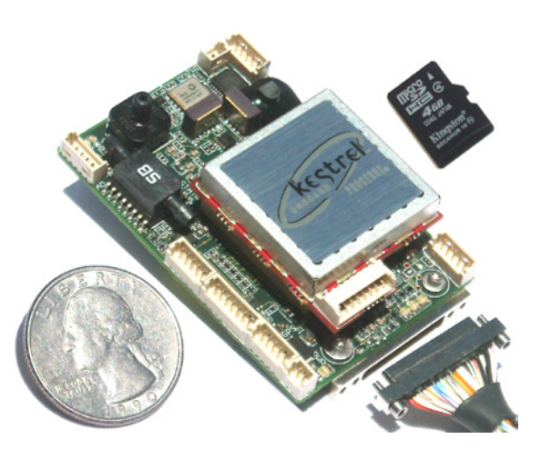
Kestrel Autopilot v3.1 2.26" x 1.46" x .67" 24 grams