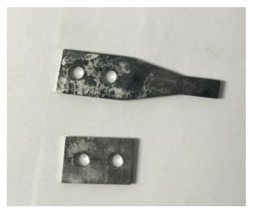
Figure 5 Improper chemical cleaning can cause additional problems.