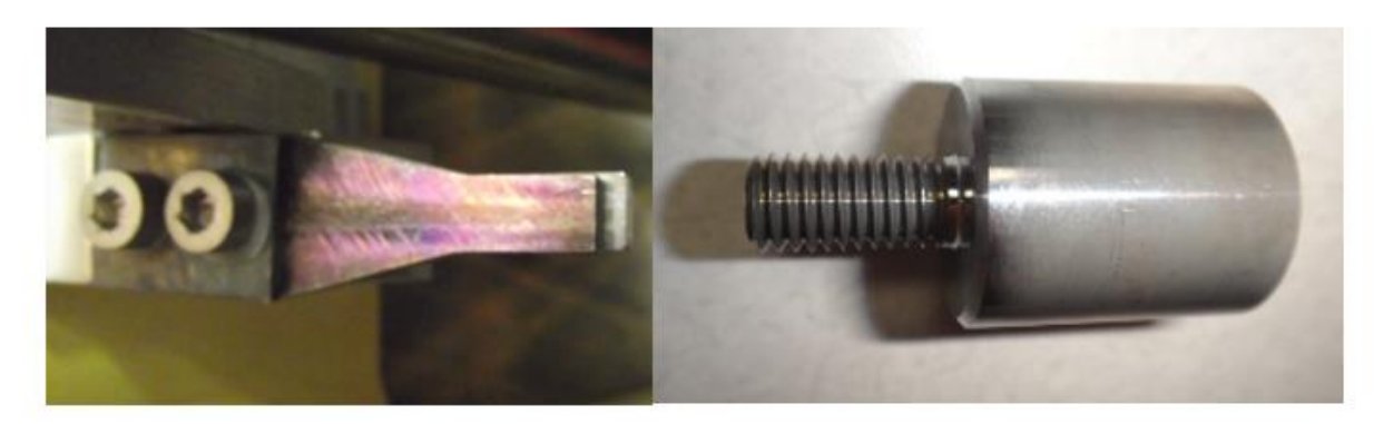
Figure 3 Examples of scale

Heat Scale, whether it is caused by heat treatment, welding or other hot work, can appear in a range of colors. It can be very light and gray, through blues and purples and back to very light blues (Figure 3). The different alloys, different temperatures, as well as different contaminants can affect the color of the scale. Below is one example of a heat treat rainbow (Figure 4), starting at lower temperatures to the left and ranging to higher temperatures on the right.