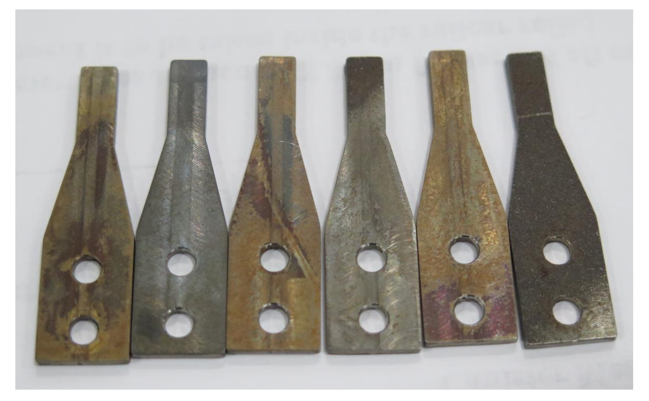
Figure 1 Various degrees of scale.

Paragraph 3.1.1 of AMS2700 states "Passivation shall be performed only on surfaces free from water breaks and visible rust or scale." This means that dirt, oils, rust, smut, carbon deposits, oxide layers, scale on the stainless steel parts MUST be removed prior to passivation. Yard scale is not acceptable, as neither is heat scale, mill scale etc. The parts shown in Figure 1 below all show varying degrees of scale; none of the parts shown below are acceptable.